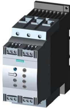
SIRIUS soft starter S3 80 A, 45 kW/400 V, 40 °C 200-480 V AC, 110-230 V AC/DC Screw terminals